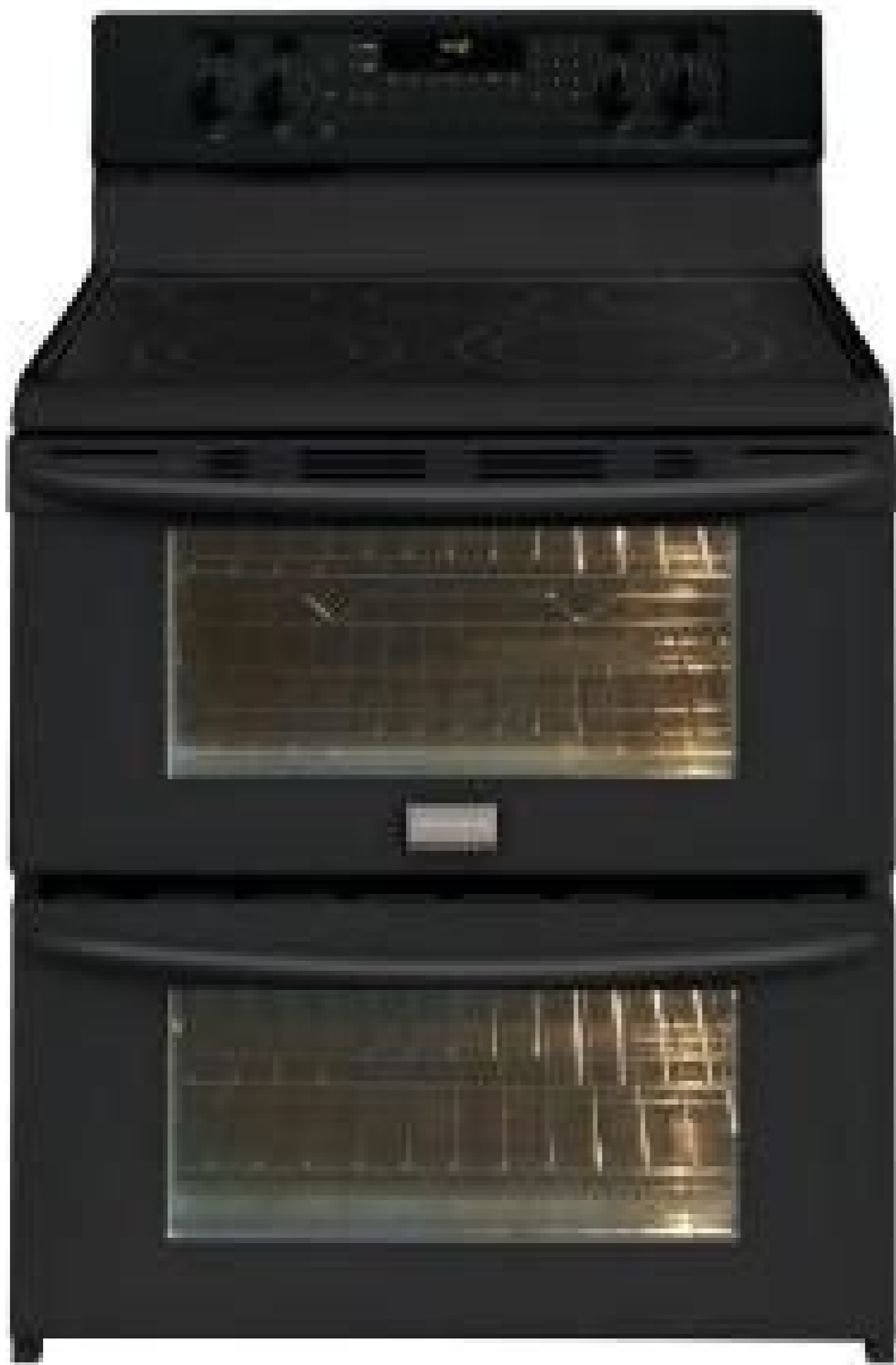
Frigidaire professional oven error codes, Frigidaire professional oven probe, Frigidaire professional oven not heating, Frigidaire professional oven manual, Frigidaire professional oven error codes f16, Frigidaire professional oven self clean, Frigidaire professional oven thermometer, Frigidaire professional oven microwave combo.